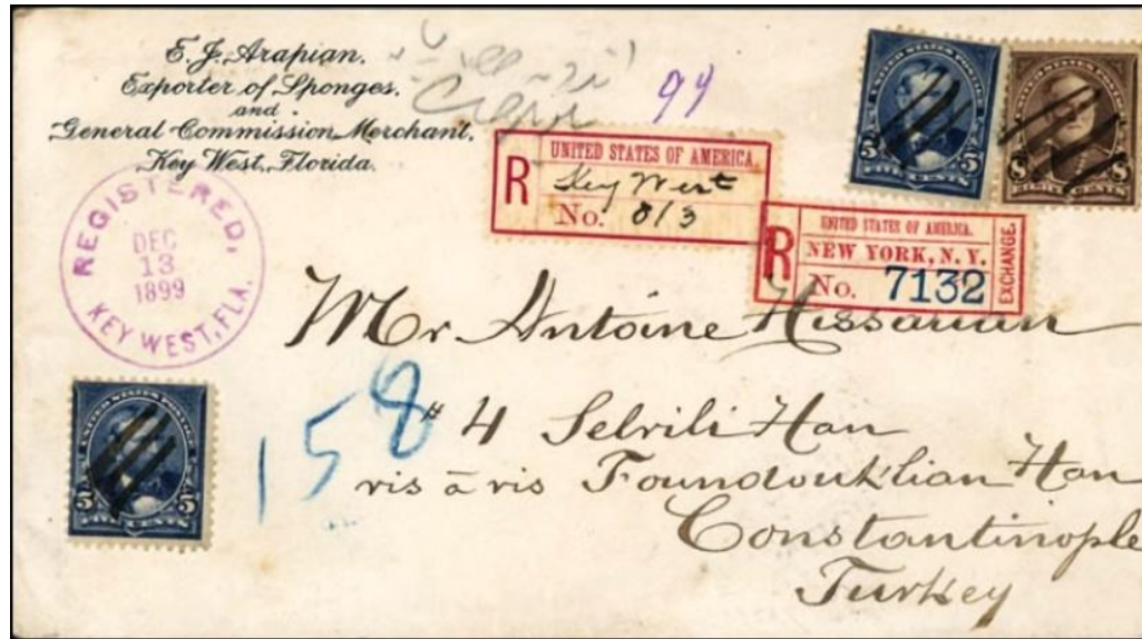
Figure 11. Key West, Type FX-KW3, No. 813.

Figure 11 above is a Key West registry label with manuscript name and No. 813, to Constantinople, Turkey using two 5¢ dark blue (Scott 281) and one 8¢ violet-brown (Scott 272) stamps with a magenta CDS REGISTERED KEY WEST, FLA.. dated Dec 13, 1899, and a New York Registry Exchange Label No. 7132.