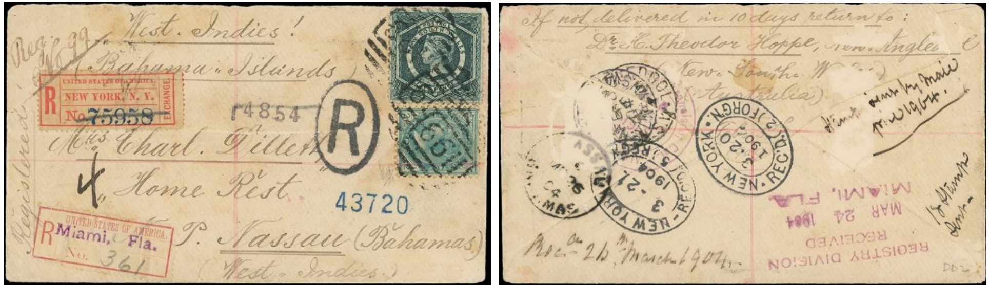
Figure 12. 1904 cover from New South Wales to Nassau, Bahamas, with Miami, Fla. and New York, Registry Exchange Labels.

Figure 12 is a Miami, Fla. Registry Exchange Label, Type FX-MA2 purple handstamp and manuscript No. 361, used in conjunction with New York Registry Exchange Label (FX-NY1a) on a 1904 cover from New Angledool, New South Wales to Nassau, Bahamas. It is franked with 5½d postage tied by two “1199” barred ovals, and a large “Oval R” handstamp.