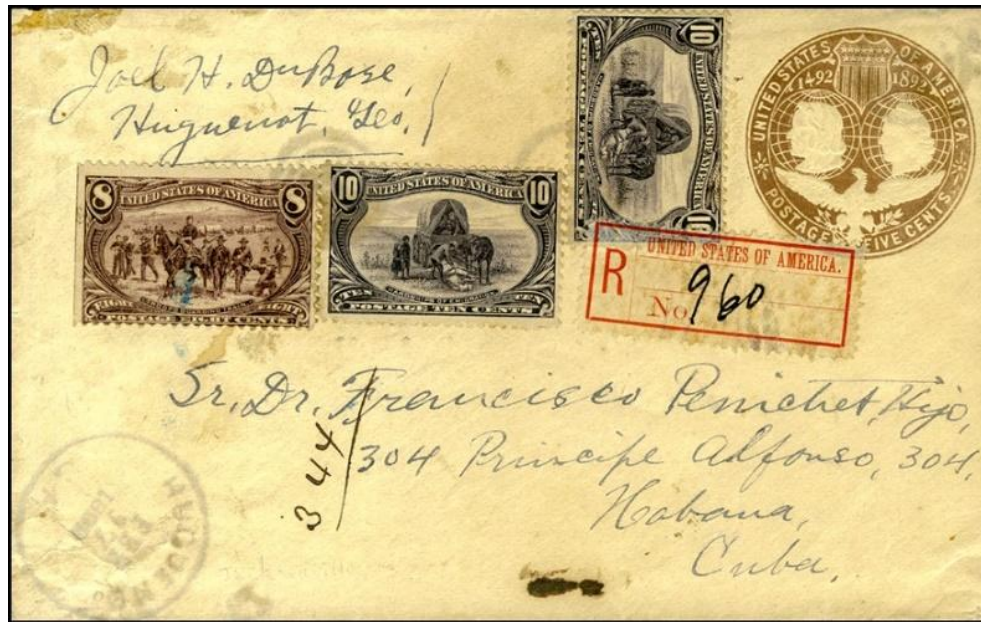
Figure 7. Type FX-JA4 on 1899 letter from Huguenot, Ga. to Havana, Cuba.

Figure 7 Registry Exchange Label has a manuscript No. 960. The Jacksonville receiving stamp on the reverse shows the Utility Label was used at Jacksonville but without a post office name added to the label. The cover is a 5¢ Columbian entire with one 8¢ (Scott 289) and two 10¢ (Scott 290) Trans-Mississippi stamps tied by small target cancels postmarked with a Huguenot Ga. Feb 17, 1899 CDS.