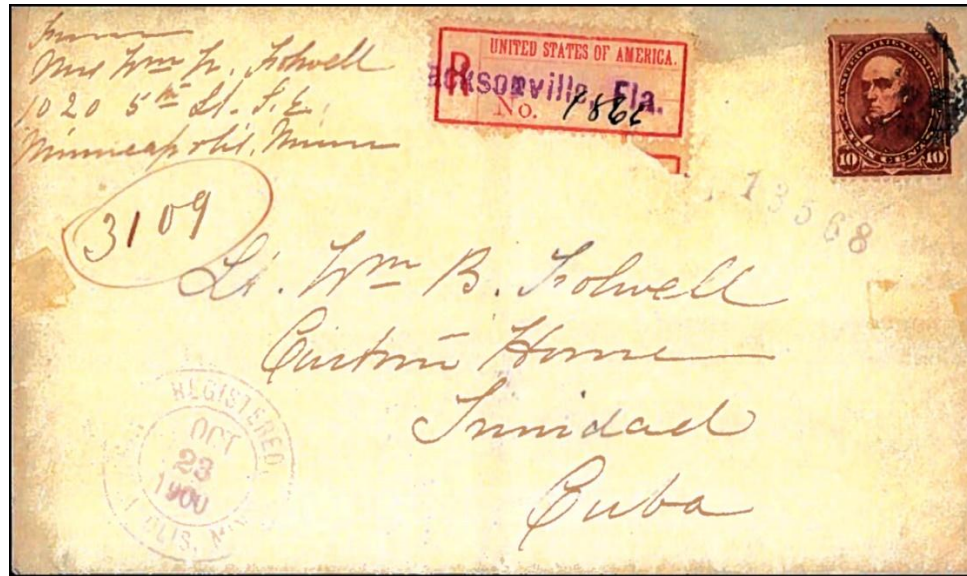
Figure 4. (J)acksonville Fla., Type FX-JA-2, from Minneapolis to Trinidad. Cuba. (Courtesy of Matthew Bennett International, Sale 280, Lot 2075.)

The Utility Exchange Label was handstamped (J)acksonville Fla. with manuscript No. 1866 (Figure 4), and has a 10¢ orange-brown (Scott 283) stamp and, in lower left, a “Registered Minneapolis, Minn. Oct 23, 1900” double circle date stamp (DCDS). On the reverse are Jacksonville and Trinidad, Cuba backstamps.