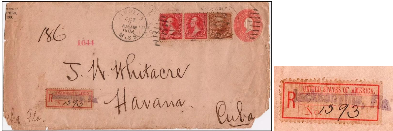
Figure 5. Type FX-JA2 on 1902 letter from Tupelo, MS to Havana, Cuba.

This magenta lower case Jacksonville Fla. handstamp, Type FX-JA2, Registry Exchange Label and manuscript No. 1593 on legal size envelope was recently posted for sale on eBay (Figure 5). On the reverse is an Oct 9, 1902 “JACKSONVILLE FLA. RECEIVING REG. DIV.” DCDS, and a black straightline handstamp Oct 13, 1902, which may have been applied in Havana.