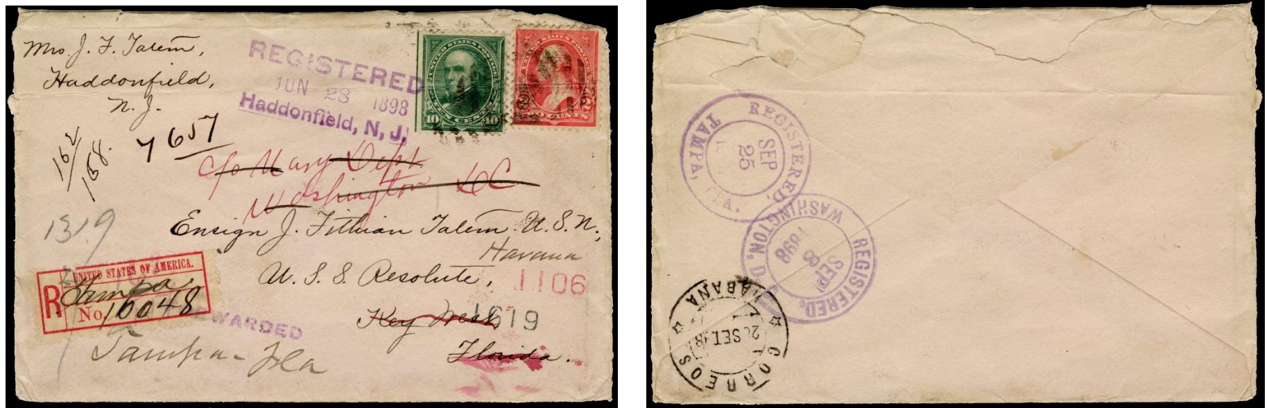
Figure 14. Type FX-TP3 Tampa on Jun 28, 1898 letter to Cuba.