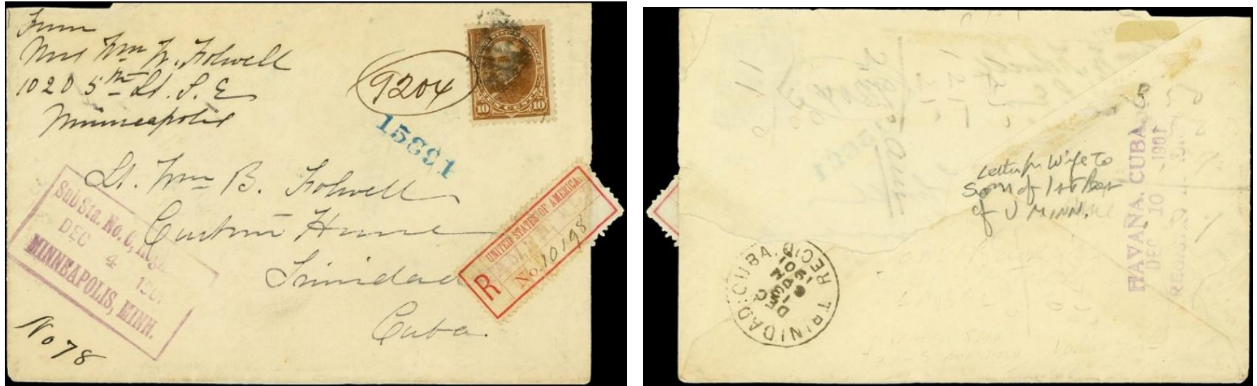
Figure 13. Type FX-TP2 TAMPA FLA 1901 cover from Minneapolis to the Custom House, Trinidad Cuba.

The Utility Registry Exchange Label is Type FX-TP2 with a faint magenta TAMPA FLA and manuscript No. 10198 (Figure 13). The cover is franked with 10¢ Type II (283) and purple “Sub Sta. No. 6, Registered, Dec 4 1901, Minneapolis, Minn.” handstamp. The reverse has Havana (Dec 10) and Trinidad (Dec 13) handstamps. Unfortunately, the top flap and left side flap are missing, where the Tampa registry postmark would have been placed.