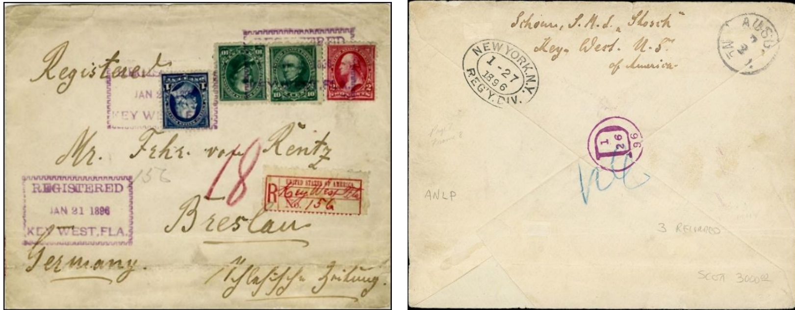
Figure 10. Key West Fla., Type FX-KW3, No. 156, on letter sent to Breslau, Germany. (Courtesy of Kewruga Sale 4 Lot 223, ex-Kugel).

Figure 10 shows another Key West Fla. Registry Exchange Label on a cover, with red manuscript town name and No. 156, sent on the German warship S.M.S. Storch to Breslau, Germany. It was franked with 1¢, 2¢, and two 10¢ First Bureau issues (Scott 264, 267, 258) tied by two of the three framed magenta “REGISTERED JAN 21, 1896 KEY WEST FLA.” handstamp.