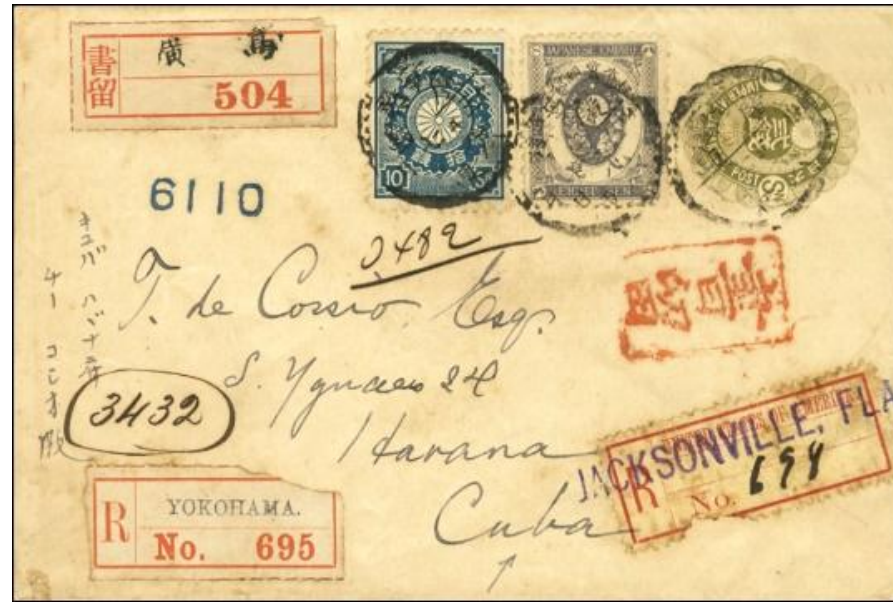
Figure 2. JACKSONVILLE FLA. Registry Exchange Label on Japanese Registered Letter.

The violet JACKSONVILLE FLA (all caps), Type FX-JA2, with manuscript No. 698, used on 2s (sen) postal stationery entire from Yokohama, Japan to Havana, Cuba, was additionally franked with 8s and 10s stamps, and on the left are two Yokohama Exchange Registry Labels, one in Japanese the other English (Figure 2). On the reverse is the date July 5, 1900.