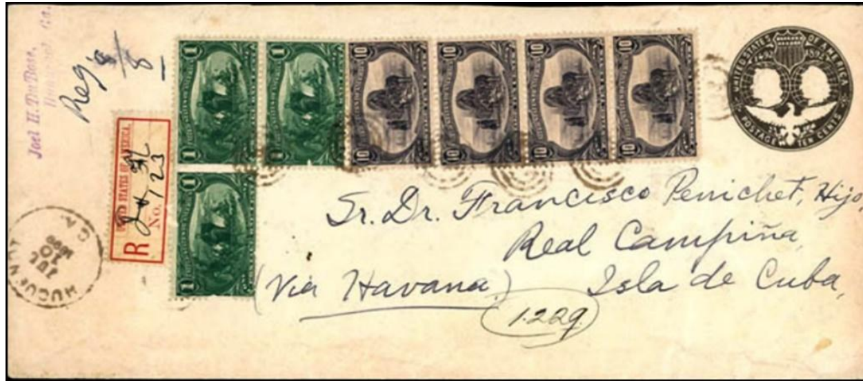
Figure 6. 1899 cover with Type FX-JA3, Jax FL , to Real Campiña, Cuba.

In the upper left corner of Figure 6 is a Joel H. DuBose postmaster magenta handstamp. The Registry Exchange Label shows a manuscript Jax FL (Jacksonville, Florida) and manuscript No. 123 on a legal size 10¢ Columbian entire, to Cuba bearing three 1¢ (Scott 285) and four 10¢ Trans-Mississippi stamps (Scott 290), all tied by matching target cancels. The letter originated at Huguenot, Ga. on Jul 10, 1899.