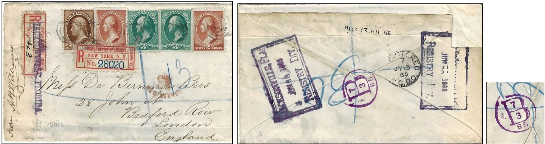
Figure 1. JACKSONVILLE FLORIDA . Type FX-JA2, with Exchange Label 43 and NY Exchange Label 26020.

Jacksonville has several different types of registry exchange labels. FX-JA2 has a magenta or violet JACKSONVILLE FLA or JACKSONVILLE FLORIDA (upper case) or Jacksonville Fla (lower case) handstamp, and the Type FX-JA3 has Jax Fl manuscript. The last type FX-JA4 is a Utility Label with no town name and was identified by the handstamp on the reverse.