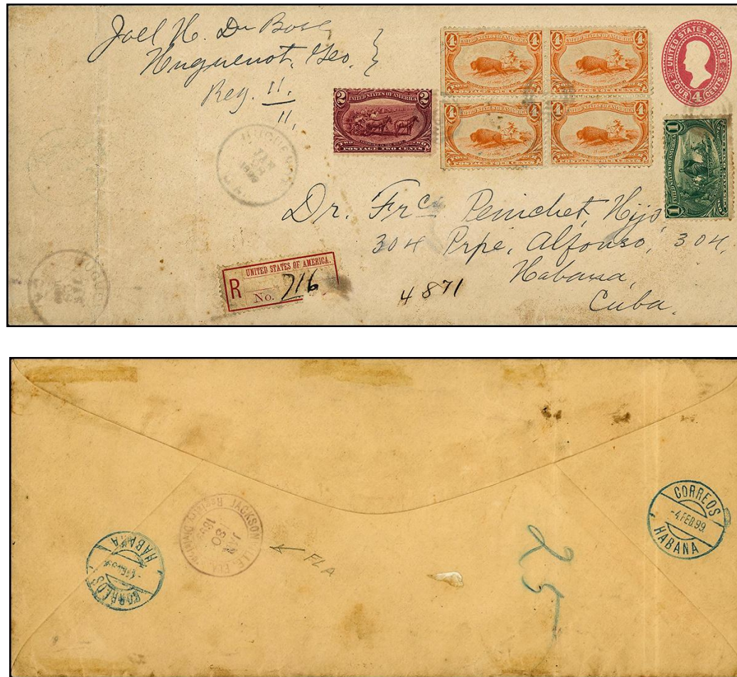
Figure 8. Type FX-JA4 from Huguenot, Ga to Havana, Cuba.

Figure 8 shows a blank Utility Exchange Label with no town name and manuscript No. 716 on 4¢ entire to Havana, Cuba with 1¢ and 2¢ Trans-Miss (285, 286), and 4¢ Trans Miss (287) block of four and “Huguenot Ga. Jan 28 1899” CDS. The reverse has a purple “ Jacksonville , Registry Division, Jan 30 1899” transit CDS and two strikes of a blue Havana (Feb 4) arrival CDS. It is assumed the label originated in Jacksonville.